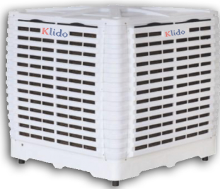
KY18 - DA