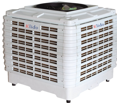
KY30 - TA